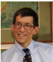
Jim diagnosed at 42

TO RECEIVE AN INVITATION OR LEARN MORE ABOUT THE PSA CALL 800-223-2732