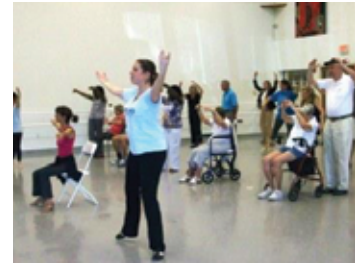
BBT4PD participants during class

BBT4PD is more than a fun acronym it is a dance program that allows people with Parkinson's disease to manage stress, reduce tremors and improve posture and balance while encouraging a positive attitude and sense of accomplishment.