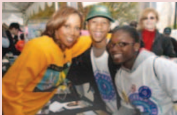
Actress Holly Robinson Peete, left, helping to launch "Proud Hands Personal Victories with Parkinson's/A Show of Hands" last month.