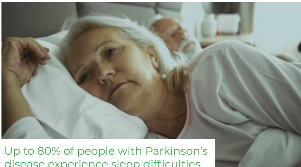
Up to 80% of people with Parkinson’s disease experience sleep difficulties.